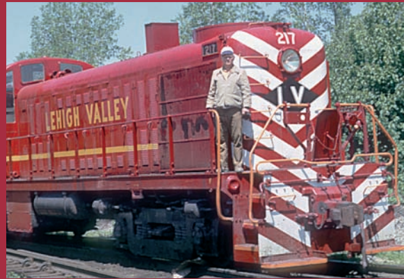
The author at Geneva in 1973.