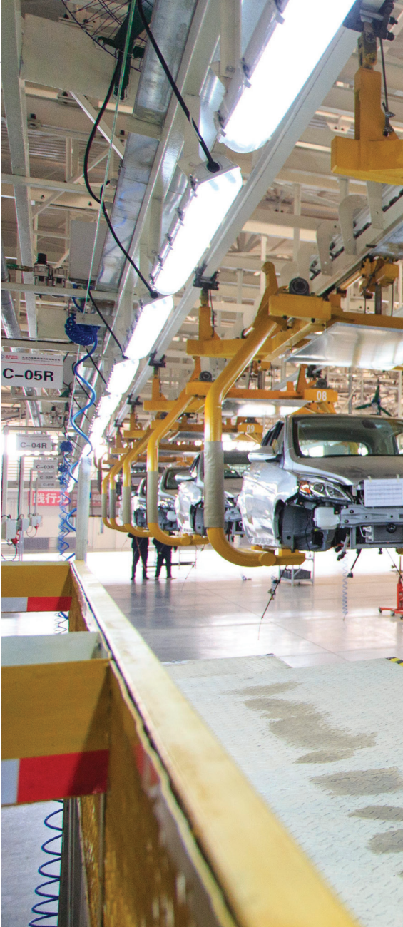
A worker at the EV development center of the Beijing Automotive Group, which was created with Beijing government support.

China's ambitious goal-setting has happened amid doubts about the EV sector's prospects for scaling up internationally. Toyota, for example, recently delayed the launch of its electric vehicle, eQ, citing misjudgment of demand in the pure EV market coupled with continuing difficulties in improving battery technology. Switching a country or a region to a new generation of environmental technologies like electric vehicles requires the coordination of many actors—car manufacturers, battery developers, charging infrastructure providers, governments, and consumers. Such a challenge is likely too great for any private company—even one as large and path-breaking as Toyota—to accomplish on