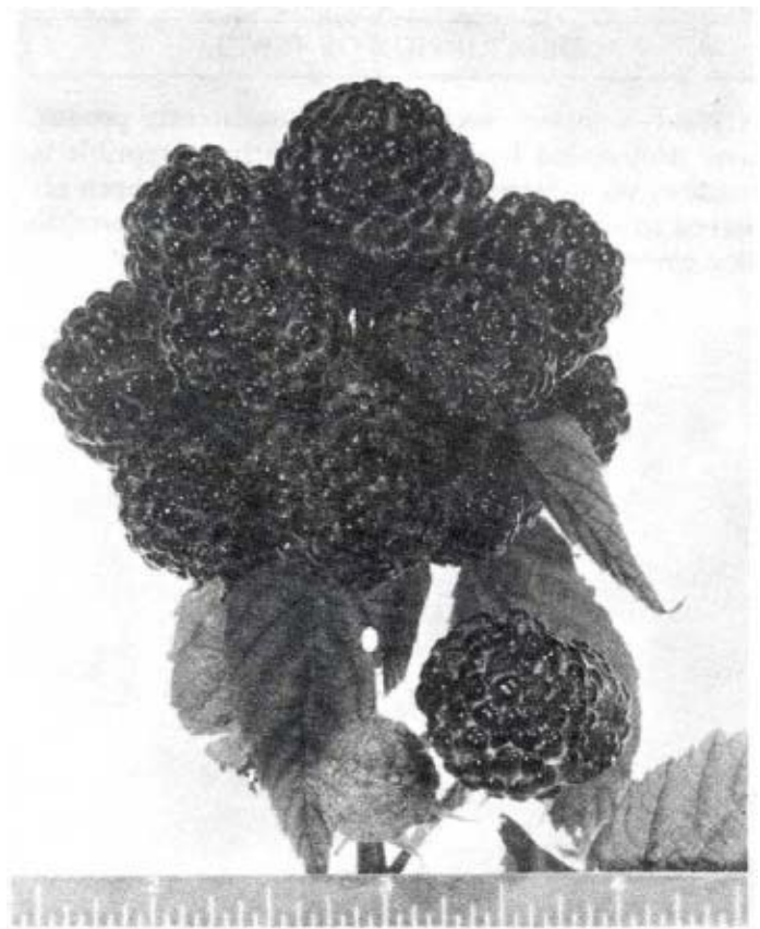
Figure 1.—Fruiting lateral from the black raspberry 'Jewel.'

H. H. Doolittle of Oaks Corners, New York improved upon nature's method of propagation by tip-layering and consequently is considered the man most responsible for increasing black raspberries on a large scale for commercial production. By 1880, western New York was considered a source for dried black caps, and, at this time, several thousand acres were under production. Since 1880, a number of selections from growers were introduced as varieties and grown on a limited scale. Several experiment stations have contributed greatly to the development of superior black raspberry varieties. The New York State Agricultural Experiment Station has released six varieties since 1927, four of which are being grown today.