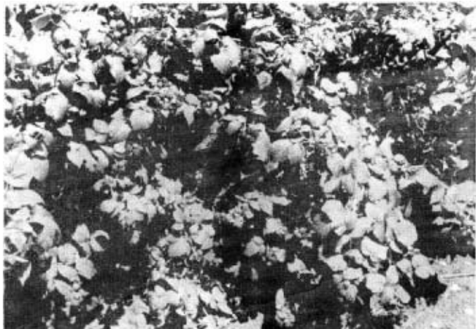
Figure 2.—Fruiting row of 'Jewel.'

cross between New York 29773 (Bristol x Dundee) x Dundee (Fig. 3). It was selected in 1957 from a population of 104 seedlings and tested as New York 628.