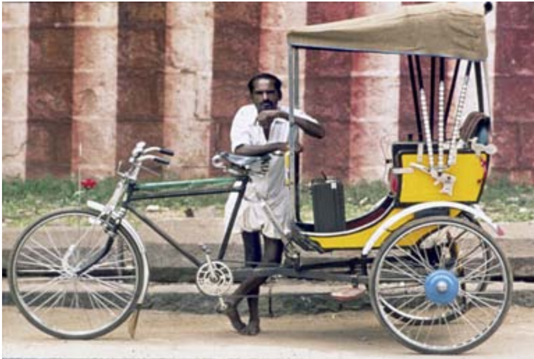
Figure 45. Rickshaw driver in front of exterior wall around precincts of Meenakshi Temple, Madurai, Tamil Nadu, India.