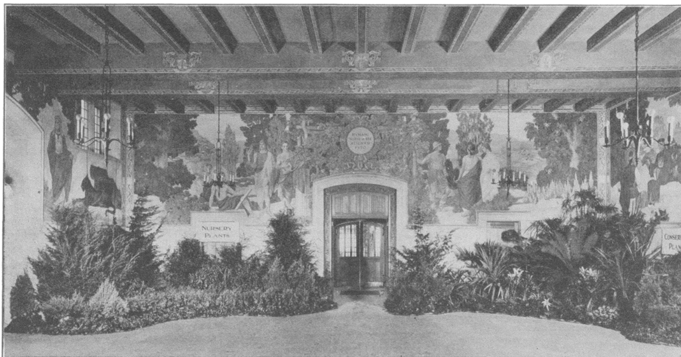
THE SPRING FLOWER SHOW IN WILLARD STRAIGHT HALL—THE LOBBY

Part III takes up the pupils and their needs, with chapters on personnel, physical, vocational, and social needs, and