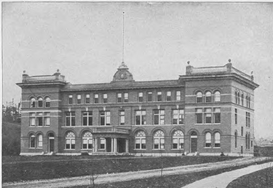
NEW YORK STATE VETERINARY COLLEGE—MAIN BUILDING