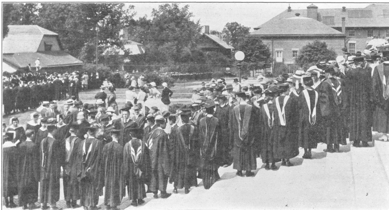
THE ACADEMIC PROCESSION