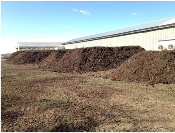
Mortality windrow with coarse carbon.

Composting may well be the answer; static pile/windrow composting may be the most efficient waste-stabilizing technology available to the processor. The fish/shells are layered into a windrow of coarse carbon. The carbon absorbs the moisture and neutralizes the odor, and the layering allows air to circulate to the microbes that are doing the work. Build a windrow or pile greater than 6 x 6 x- as long as there is space. The pile will heat due to microbial metabolism, heat will rise, and cool oxygen rich air will be pulled into the pile. If good coarse carbon is used, the air will naturally circulate, and the pile will not need to be turned. This is an essential benefit when working with putrescible, odiferous material.